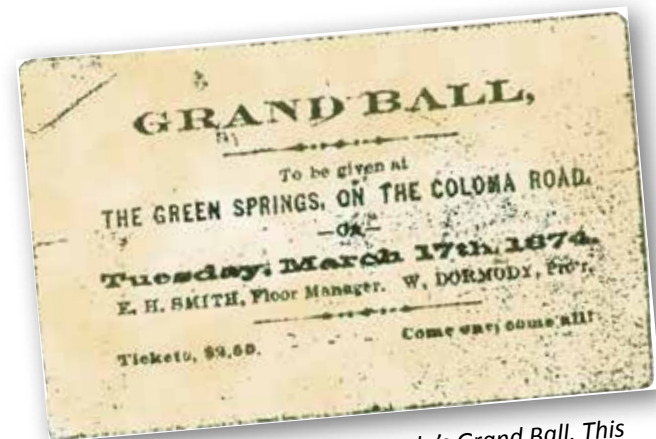
This is a ticket to an early Dormody's Grand Ball. This one was held on Tuesday, March 17, 1874.

The Green Springs House and Ranch was a premier property. It was said that only the finest materials were used to construct the house and stables. The horses were often decked out in custom silver-mounted harnesses and tack. It was said the "place was a Mecca for the influential and elite." The Dormody family was known for its formal dances and parties.