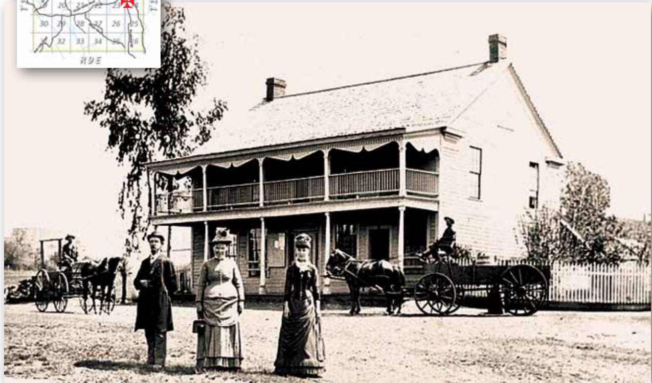
This is the Rising Sun House on the hill just east of the Carpenter Store and Rescue Post office. This picture was taken in the 1870s. The house is facing north so that the rising sun would shine in on the east wall and set on the western wall. Green Valley Road is about where the wagons are parked. The Upper Shingle Road (Ponderosa Way) is just off the picture to the right.