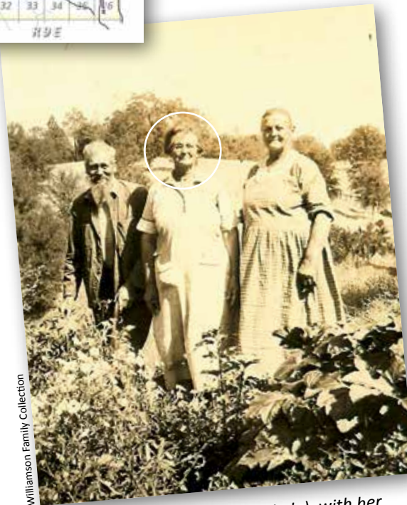
Williamson Family Collection