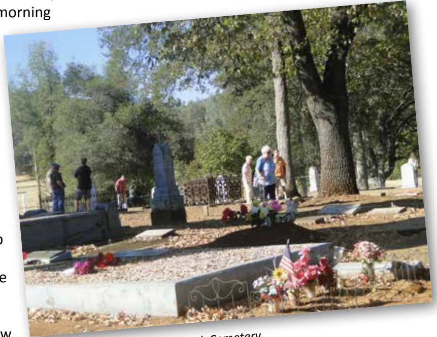
The bus tour stopped at Jayhawk Cemetery.

It should be noted that Mike Skinner, the new owner of the site was gracious enough to supply the nice banners used to advertise the bus tour.