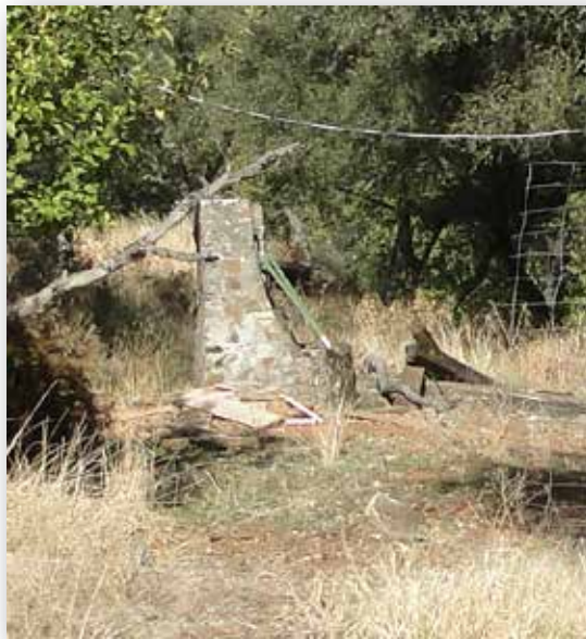
Very little remains of the Hall's Store. Hall's Store was just over the hill from this old home site.