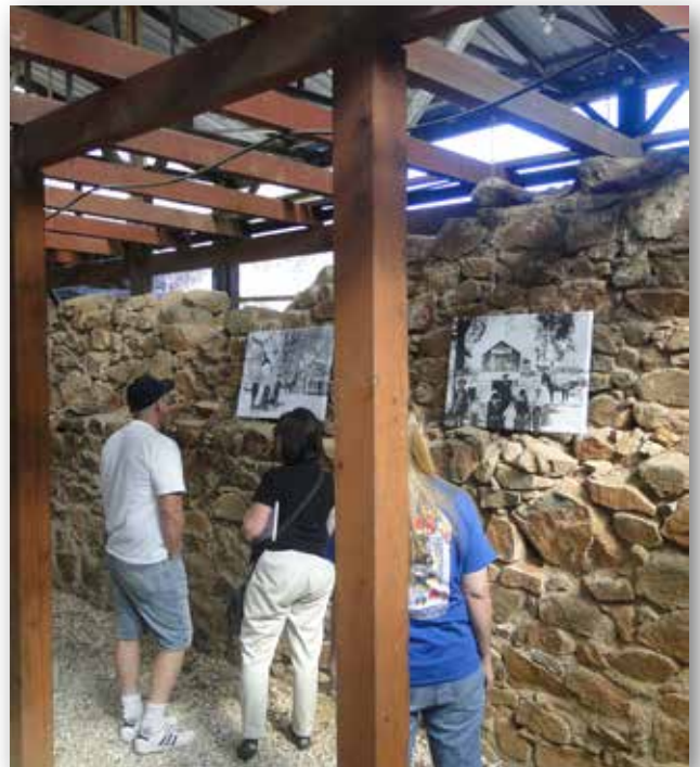
The last stop was in the Skinner Winery. This historical site will be rebuilt to its original look, soon.