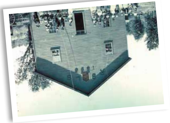
Rose Springs Literary Society Hall Constructed in 1896

Rescue Historical Society, Inc. PO Box 13 Rescue, CA 95672