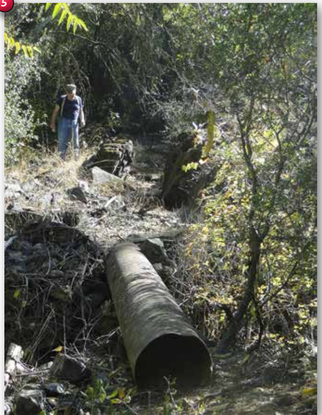
When the ditch crossed a gully that flowed water, a pipe or flume was installed to carry the ditch water over it.