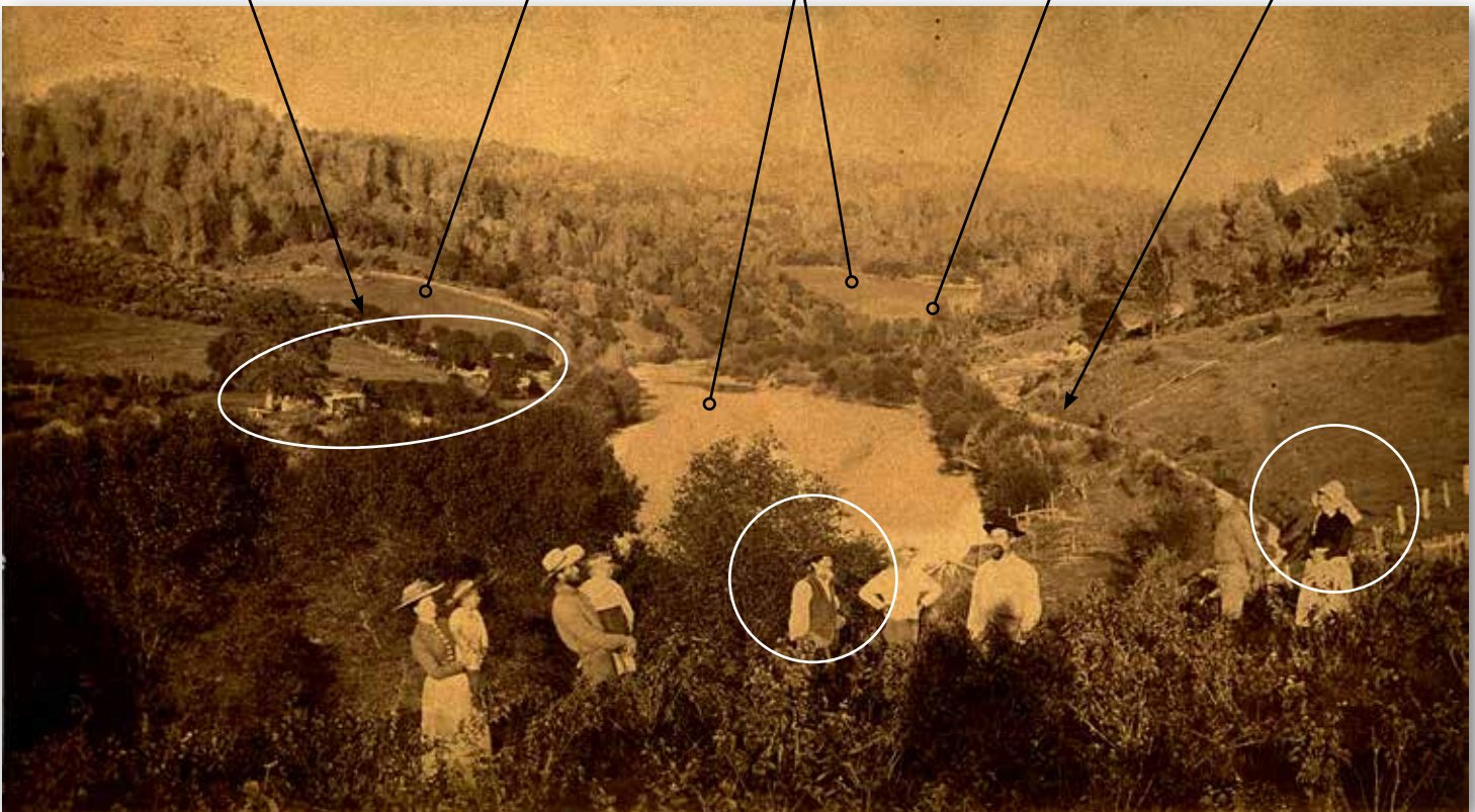
The Murphy Family Farm. 1 The Vineyard. 2 Gravel Fields. The dam was about here. 3 The Jurgens Ditch. 4

The Jurgens Ditch ran from a dam just downstream from Pinchem Creek to the Jurgens mining operations about a mile downstream.